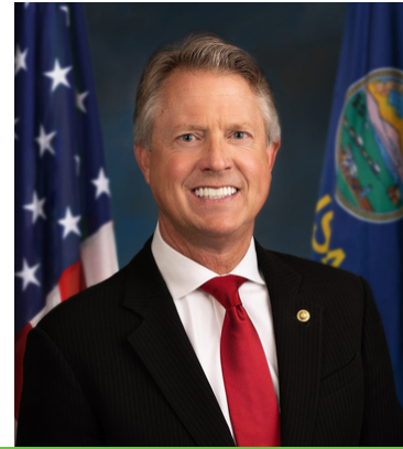
Senator Roger Marshall